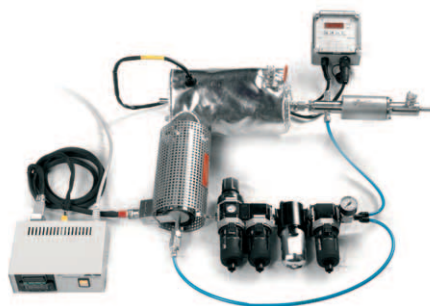
Dekati double diluter setup for combustion measurements

The nominal dilution ratio for a single Dekati® Diluter is 1:8. Every Dekati® Diluter is individually calibrated with traceably calibrated flow and pressure sensors and provided with an individual calibration certificate and data sheet. Dekati® Diluters are also available in custom dilution ratios. Please contact Dekati Ltd. for more information.